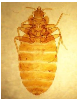
Bed bug ( cimex lectularius )

Bed bugs are a global pest problem and can be found almost everywhere and in high numbers, e.g. hotels and public transport. The innovative DCX approach saves a lot of troubles, time and money while inactivating bed bugs ( cimex lectularius ) and their eggs therefore increasing hygiene at the same time.