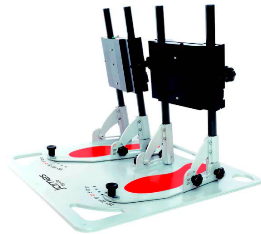
ISO 13485 certified

JAMES is a patented device that supports an optimal position of a patient's knee during standing knee acquisitions. It applies not only for joint space analyses but also for visual assessments.